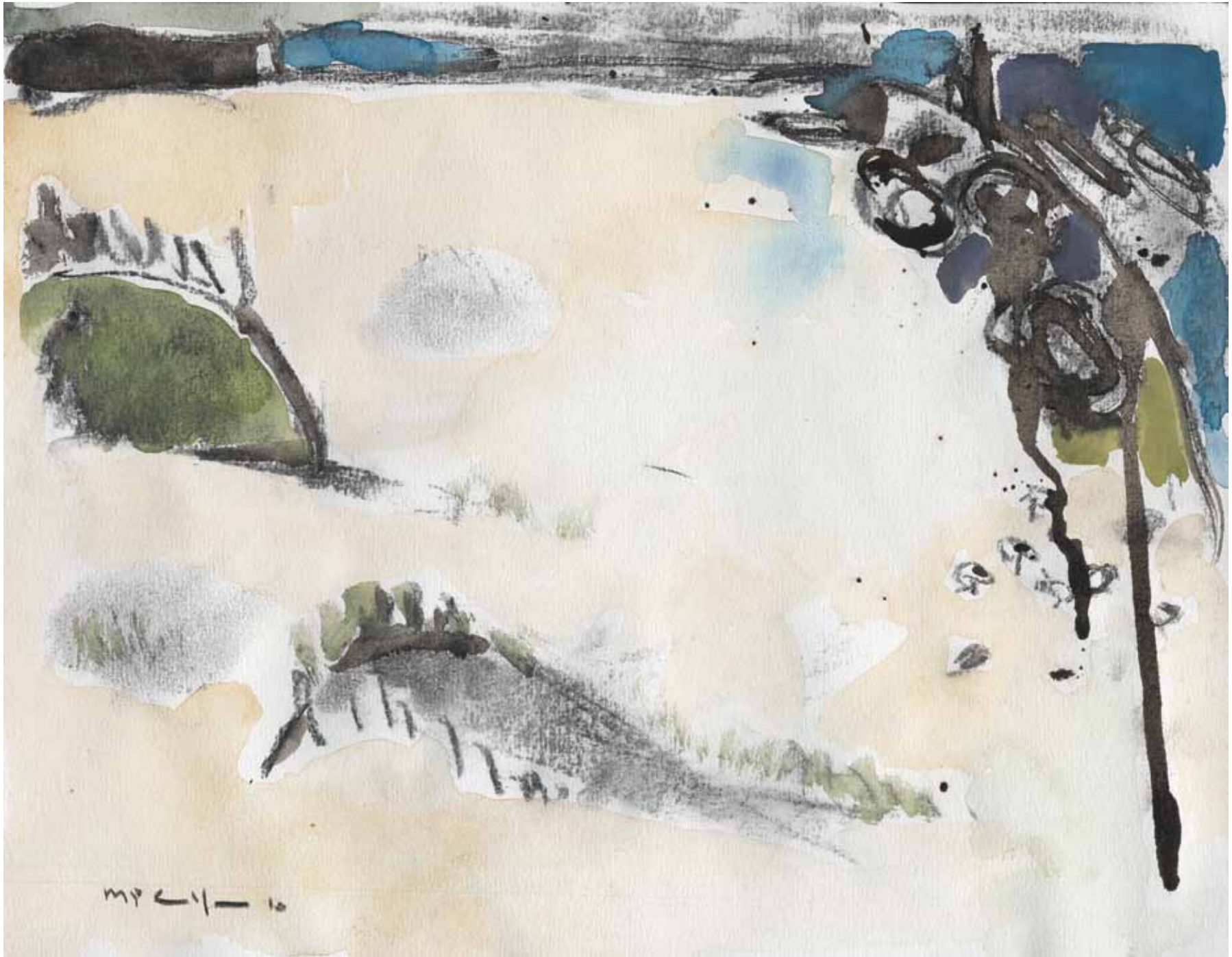
Cahore drawing 1