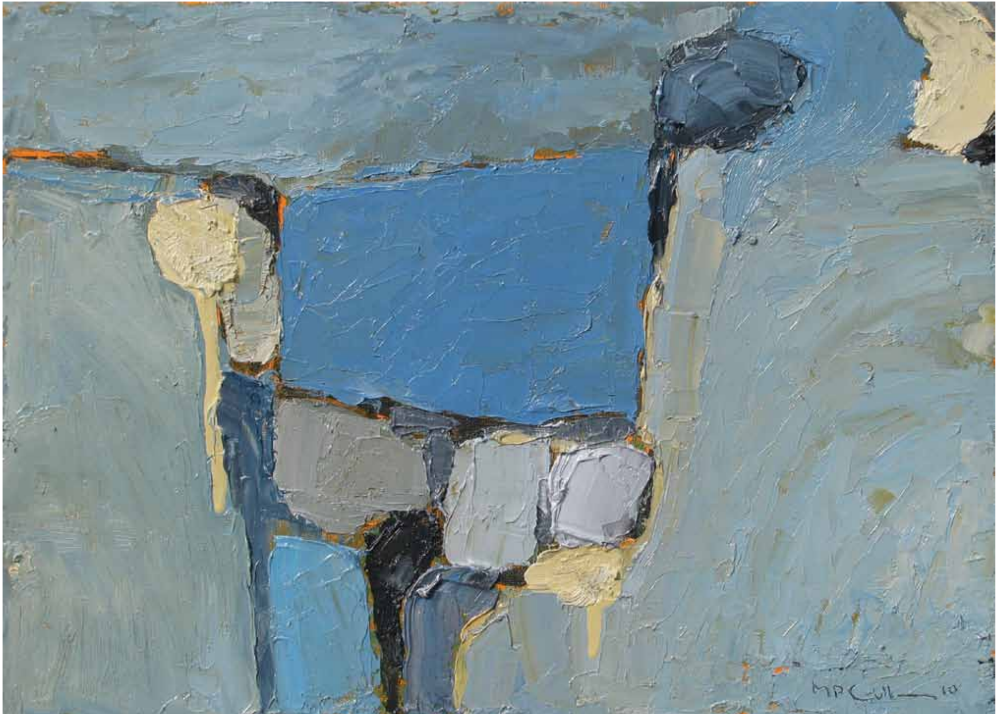
'Rock pools, Dun Laoire'