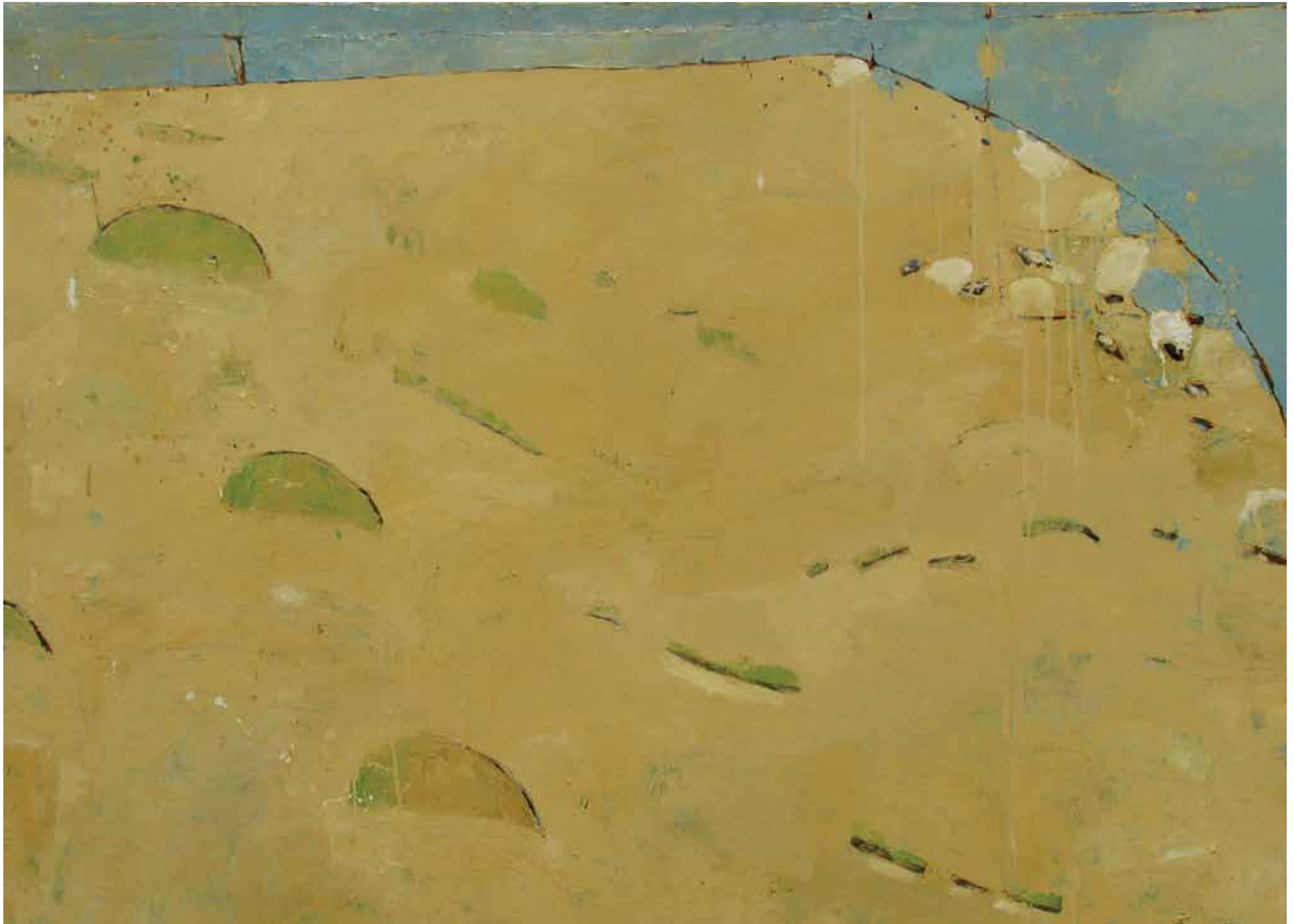
Ringed Plover, Cahore beach