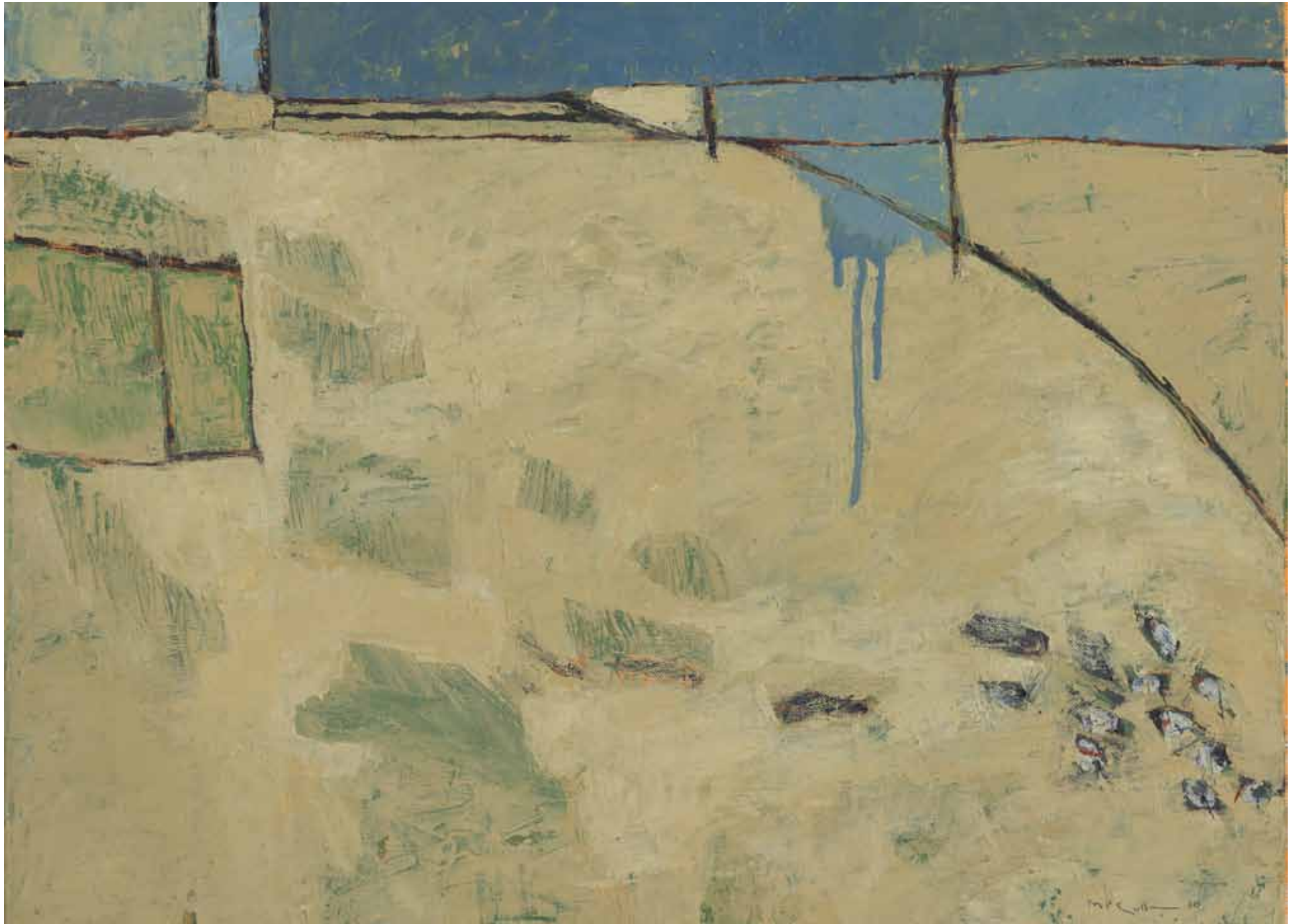
'Maran Grass and Dunlin'