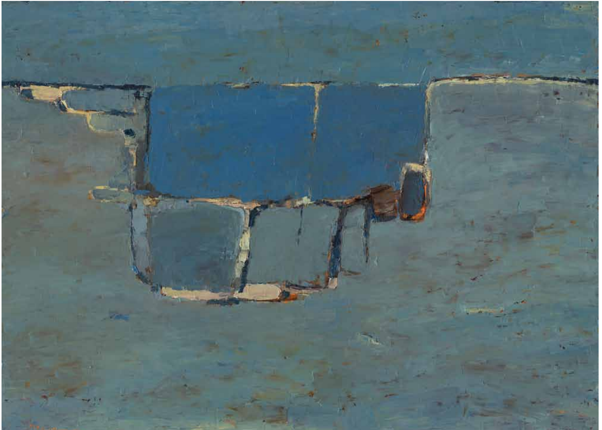
'Cliff rocks- blue bay'