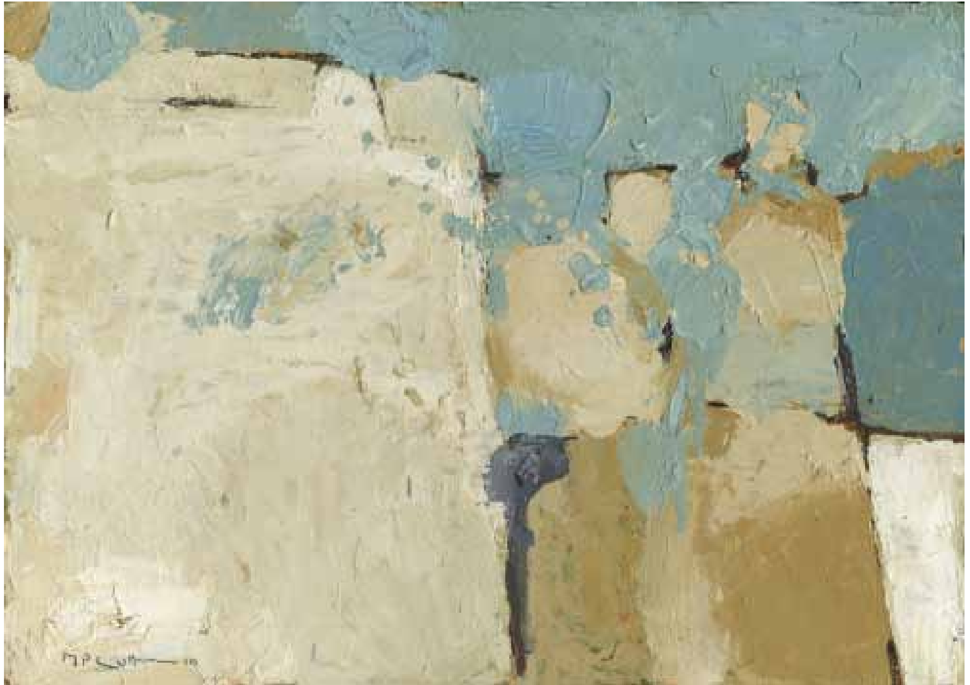
Blue crane in Summer