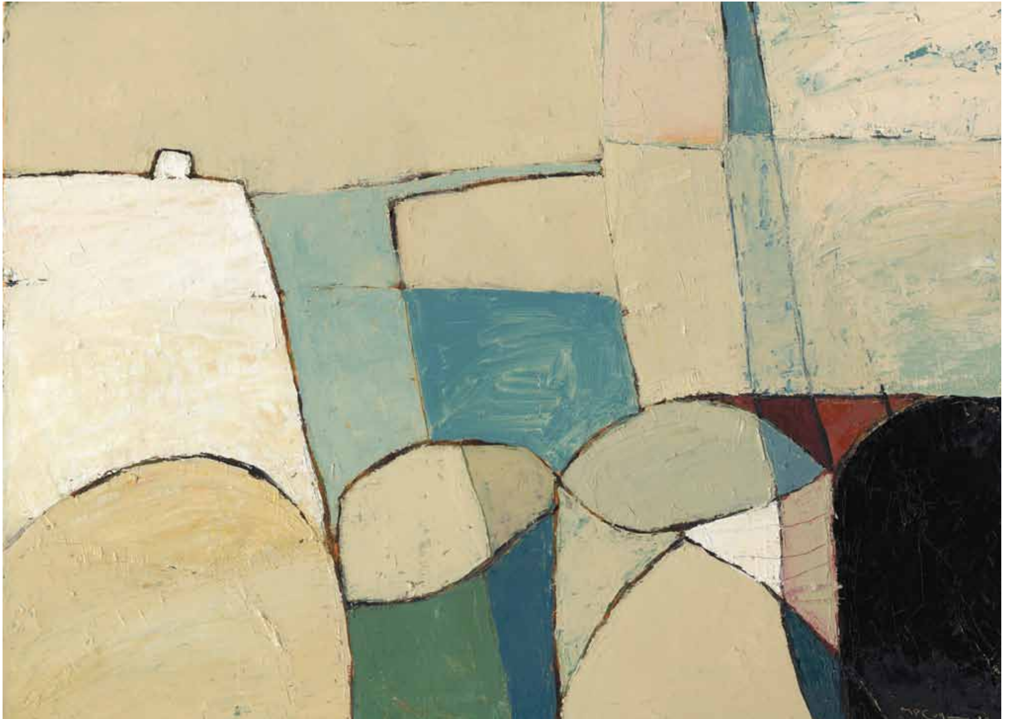
'Winter shadows, Bulloch harbour'