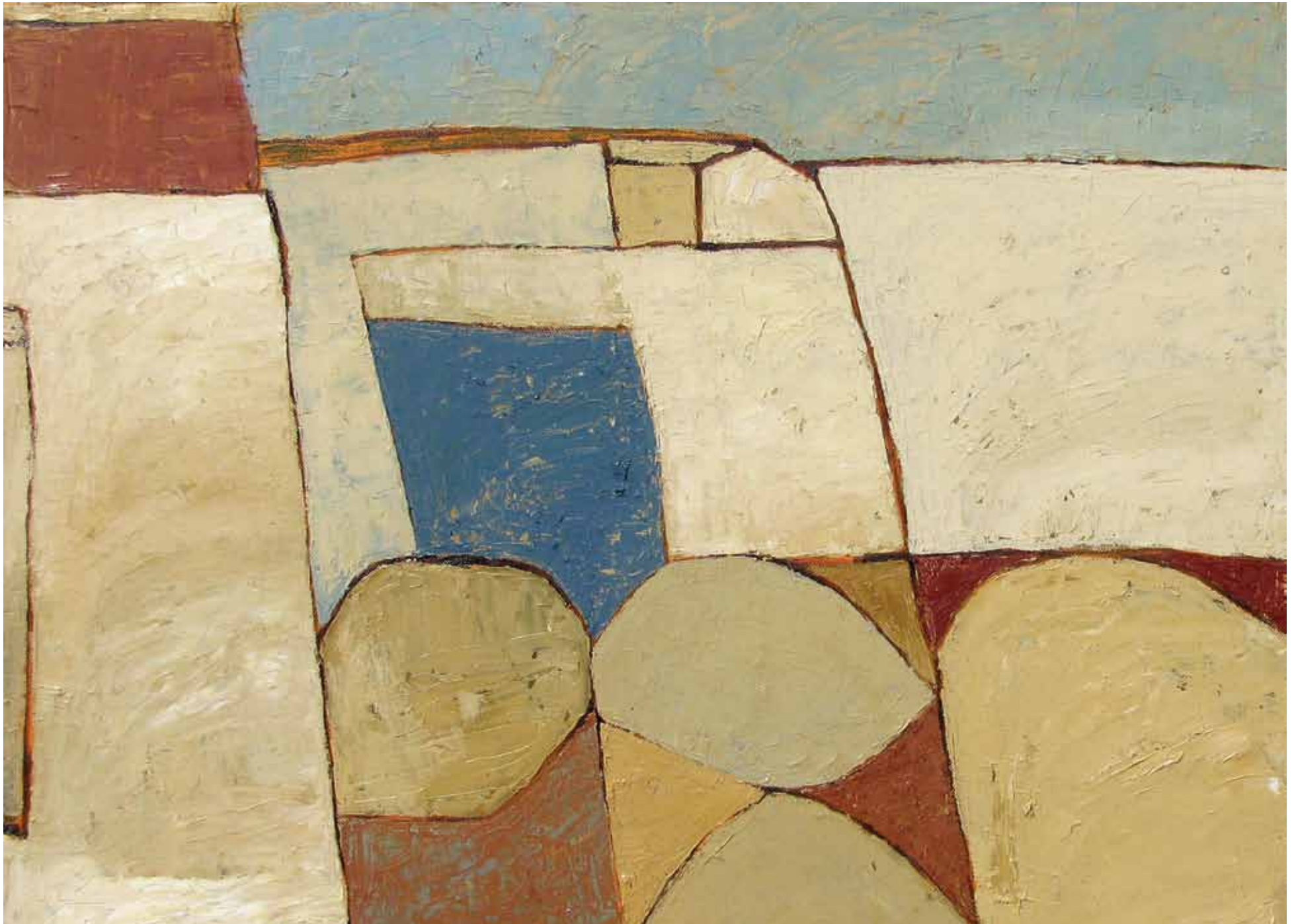
'Harbour boats with hut'