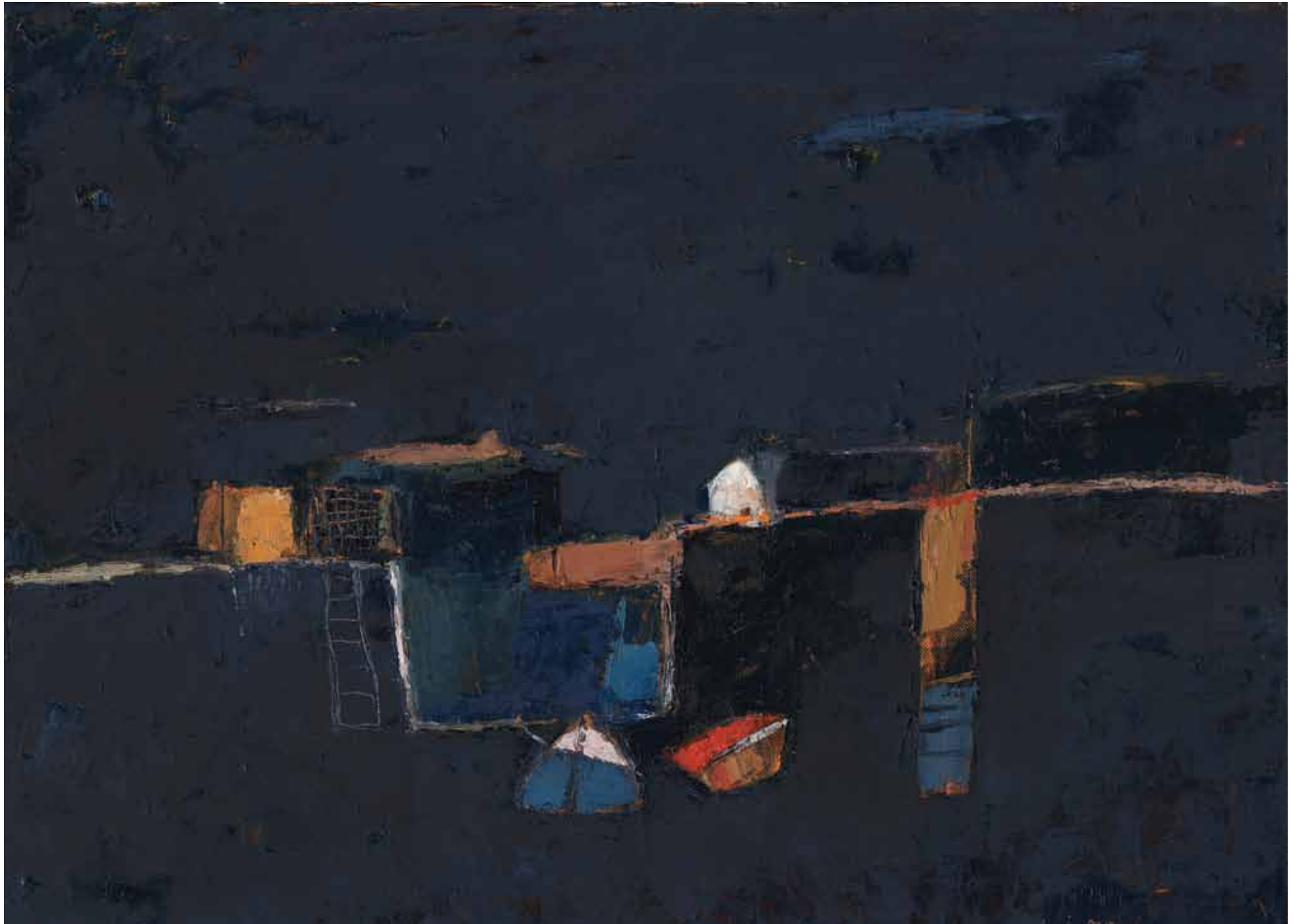
'Harbour wall with ladder'