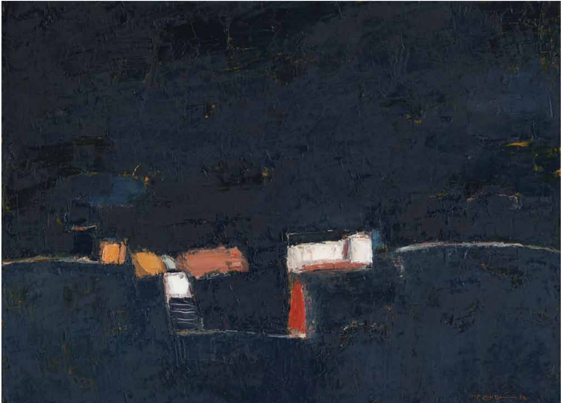
'Lobster pots, Colliemore'