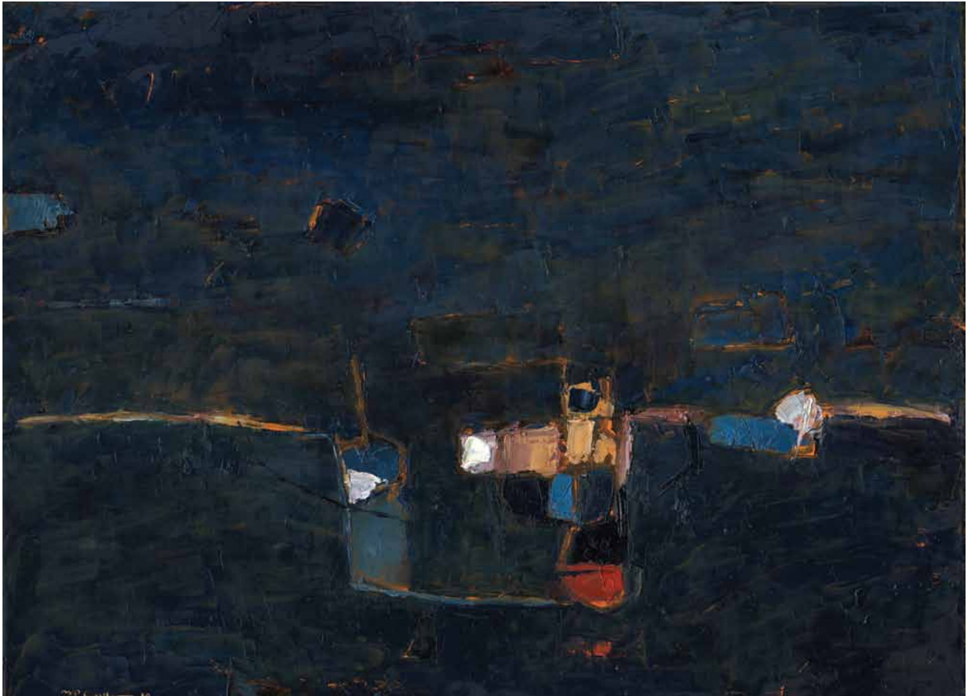
'Fishing boats at port'