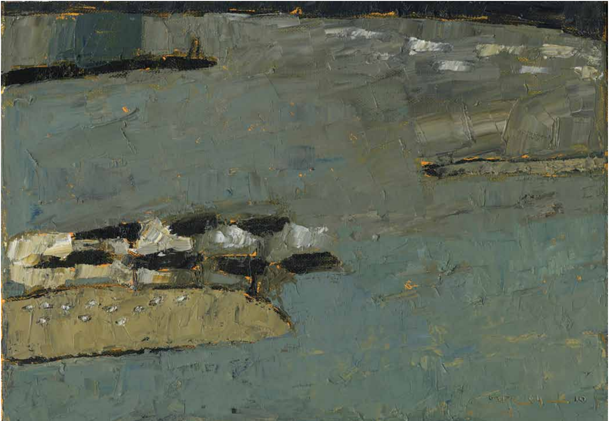
'Heavy sea-Sanderling on sandbank'