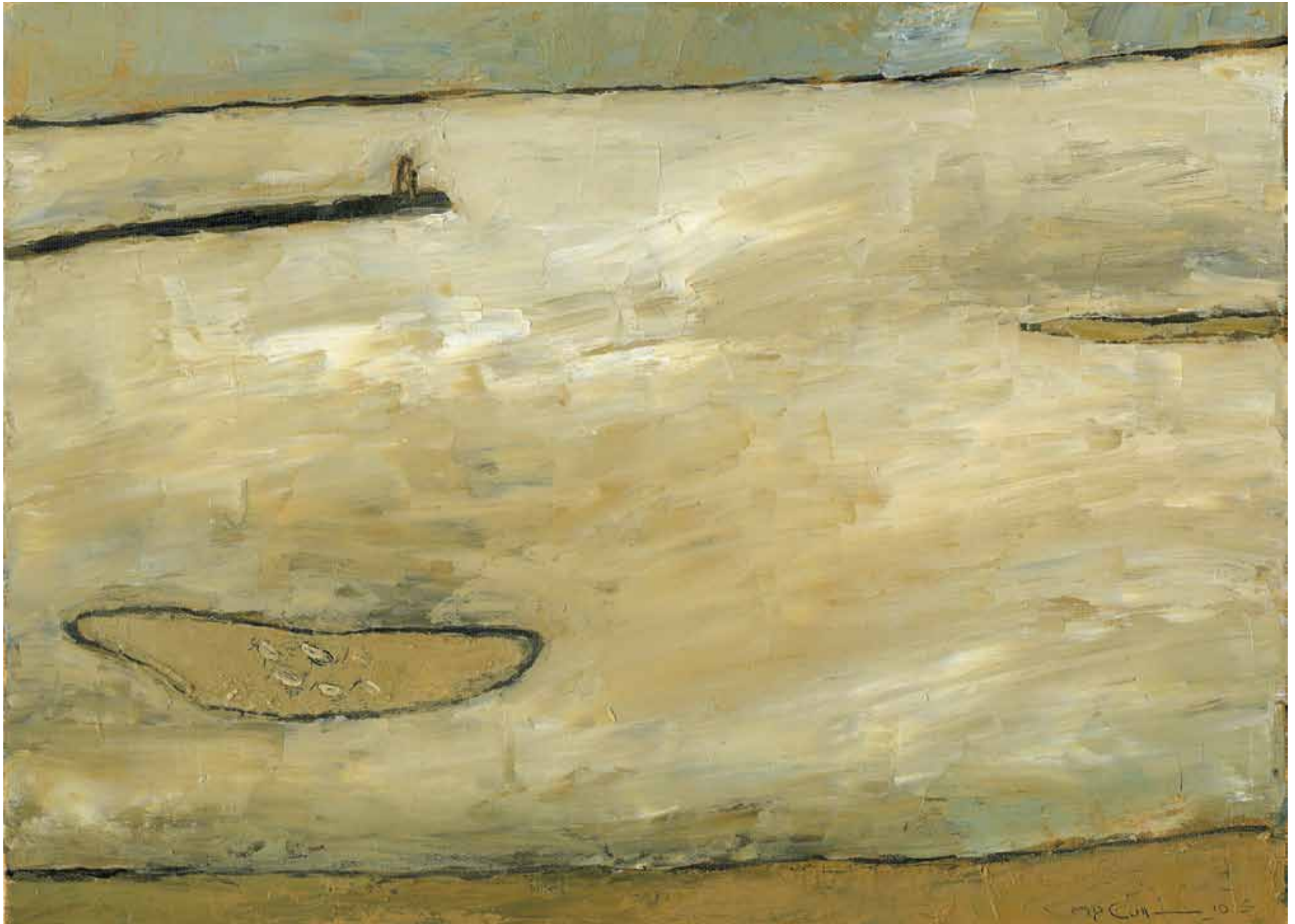
'Six sea birds'